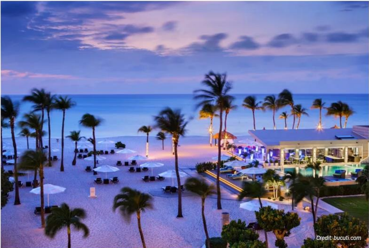
Bucuti & Tara Beach Resort

A tiny Dutch Caribbean island, Aruba has miles of picturesque white sandy beaches, sparkling turquoise waters, and breathtaking ocean views. With warm tropical weather year-round, this idyllic beach getaway offers travelers a slice of paradise filled with natural beauty and diverse landscapes just begging to be explored. Visitors are spoiled for choice in the range of world-class beach resorts to choose from, as properties boast a range of luxury amenities including gourmet restaurants, pampering spa treatments, and on-site casino access. Find out what resort could be catering to your every need at one of these top resorts in Aruba.