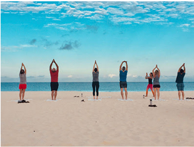
Yoga on the Beach